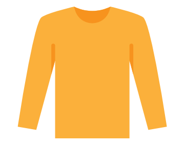
Wear a long-sleeve shirt or pants to cover your skin.

When you're outdoors, it's important to have multiple ways to protect your skin.